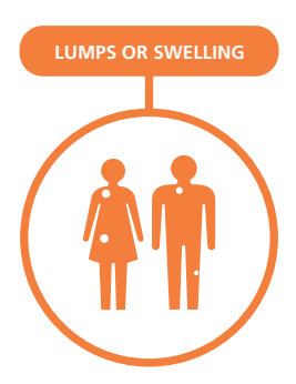
Check your whole body, not just your testicles or breasts.