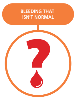
Coughing up blood or noticing it in your urine or bowel motion, or bleeding from your vagina between periods, after sex, or after the menopause.