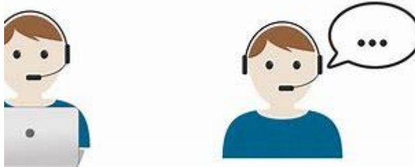
Specialised Cancer Nurse