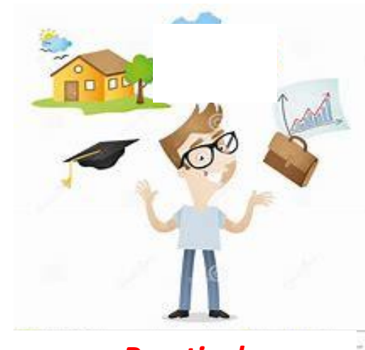
Practical & Financial Signposting