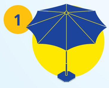
Seek shade – especially between 11am and 3pm